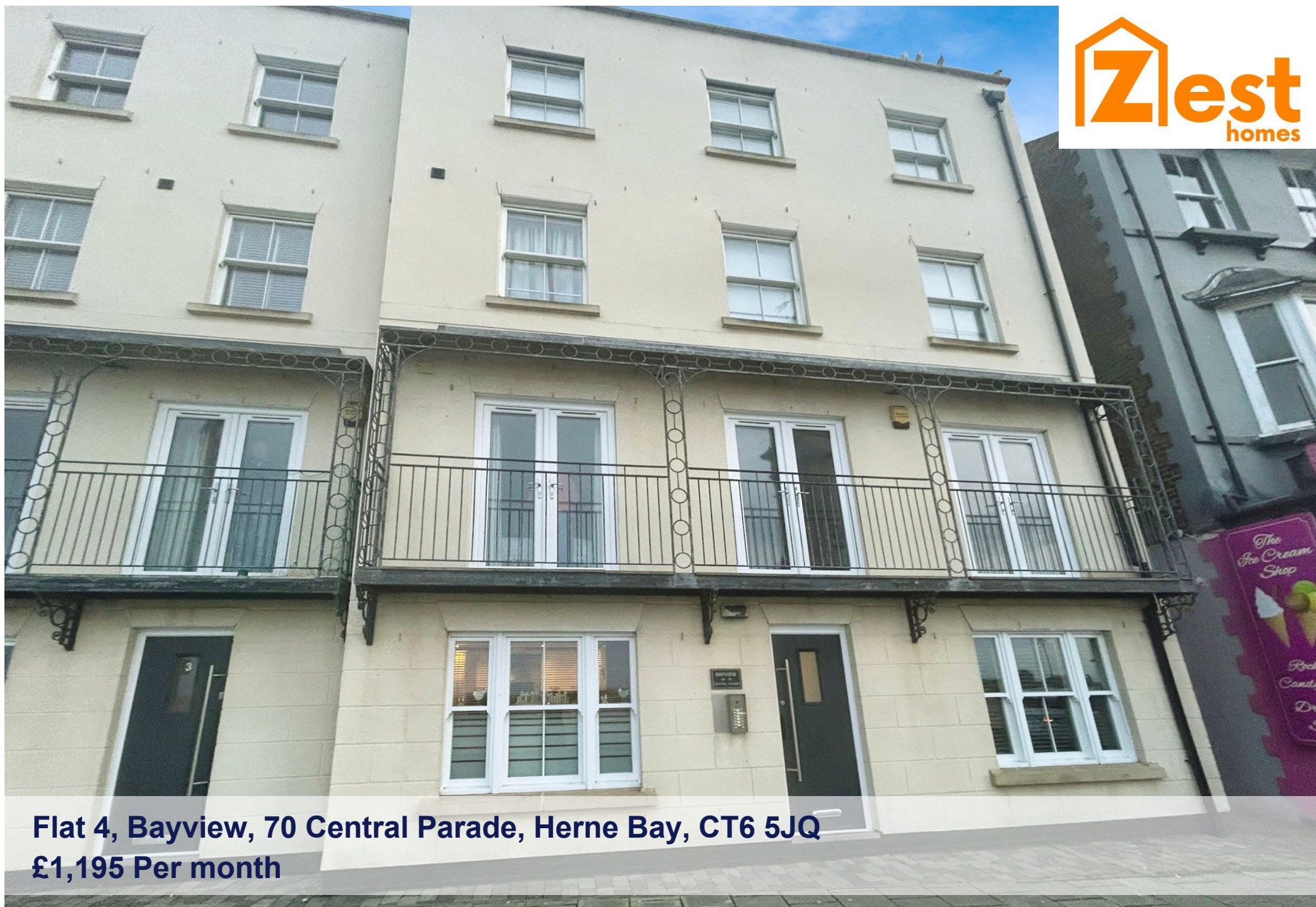
Flat 4, Bayview, 70 Central Parade, Herne Bay, CT6 5JQ £1,195 Per month